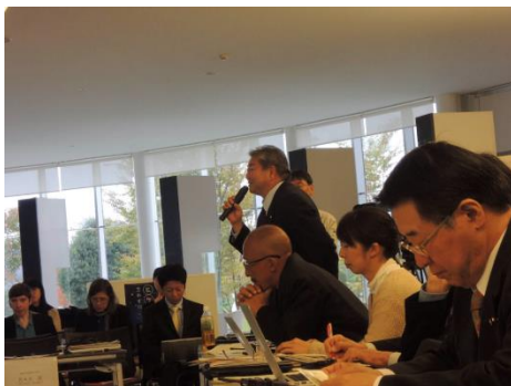
Date dialogue (Fukushima prefecture)

Many people were very anxious about radiation, regardless of the low dose. He thought that if we biologists clearly stated that they had no health effects, we could solve a few social problems, but that was wrong and a conceit. He realized that 'No matter how well-founded science is, it is absolutely useless if no one can take and understand it'. This is a quite important lesson. It was necessary to be a human being first, not be a scientist. He eventually realised the central importance of meeting real people in their own environment, talking and listening, generating a dialogue, eventually realising that the accident had a major impact on relationships and daily life. Only at this stage, when trust and mutual respect had started to be developed, could any progress be made with helping the community come to terms with radiation and risk.