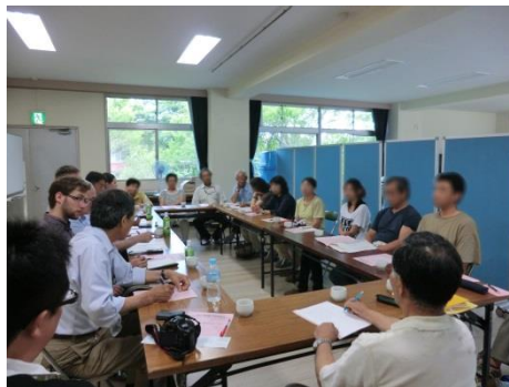
Hippo dialogue (Miyagi prefecture)

'It's not really about radiation, it's the impact on our lives'